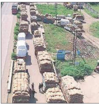
Trucks loaded with groundnut line up outside the yard of Gondal APMC in Rajkot district.

At Jamnagar APMC, the price touched the peak of Rs 7,000 as traders from Tamil Nadu went broke to secure G-9 variety stocks for being used as seeds for sowing. "More than 30 traders