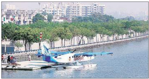
During three days of operations, an estimated 100-odd persons flew on the seaplane between the Statue of Unity and Ahmedabad.

In both the FIRs, police personnel are the complainant.